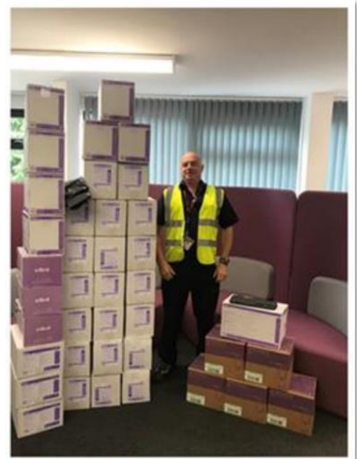
Standard monthly delivery of single-use containers for one child!